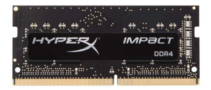
The product images shown are for illustration purposes only and may not be an exact representation of the product. Kingston reserves the right to change any information at anytime without notice.